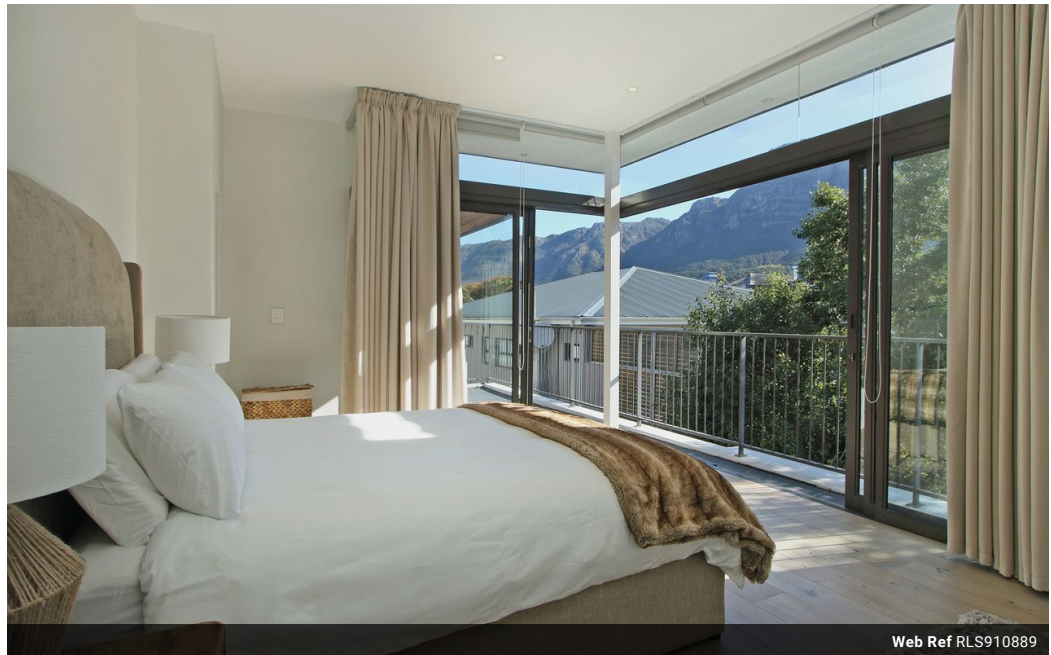
Web Ref RLS910889